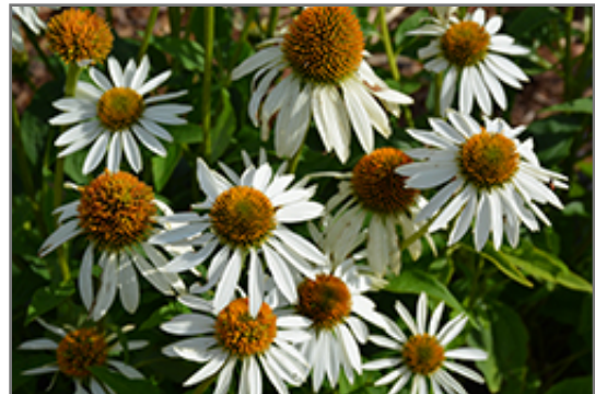
Happy Star Coneflower flowers

Happy Star Coneflower is recommended for the following landscape applications;