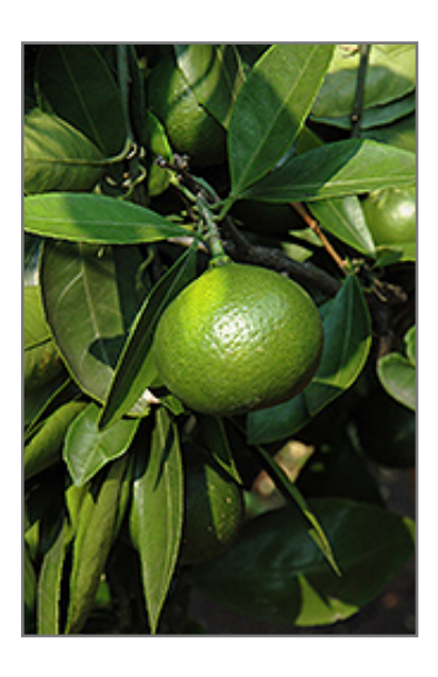
Okitsu Mandarin fruit

When grown indoors, Okitsu Mandarin can be expected to grow to be about 6 feet tall at maturity, with a spread of 6 feet. It grows at a medium rate, and under ideal conditions can be expected to live for approximately 50 years. This houseplant will do well in a location that gets either direct or indirect sunlight, although it will usually require a more brightly-lit environment than what artificial indoor lighting alone can provide. It prefers to grow in average to moist soil. The surface of the soil shouldn't be allowed to dry out completely, and so you should expect to water this plant once and possibly even twice each week. Be aware that your particular watering schedule may vary depending on its location in the room, the pot size, plant size and other conditions; if in doubt, ask one of our experts in the store for advice. It is not particular as to soil type or pH; an average potting soil should work just fine.