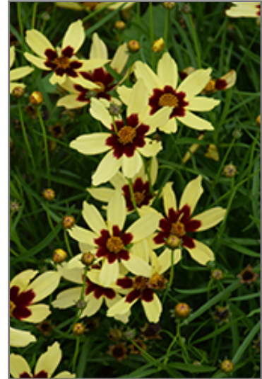
Electric Sunshine Tickseed flowers