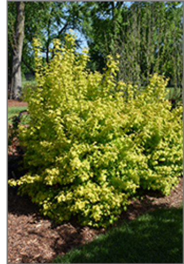
Oh Canada Cranberry Bush

This shrub does best in full sun to partial shade. It prefers to grow in average to moist conditions, and shouldn't be allowed to dry out. It may require supplemental watering during periods of drought or extended heat. It is not particular as to soil type or pH. It is highly tolerant of urban pollution and will even thrive in inner city environments. This is a selected variety of a species not originally from North America.