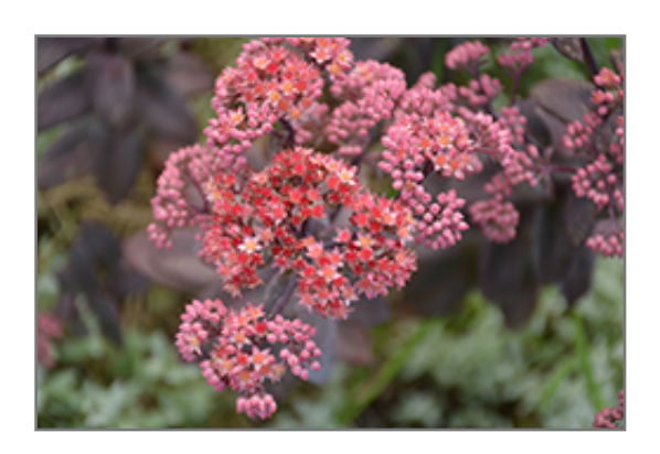
Night Embers Stonecrop flowers