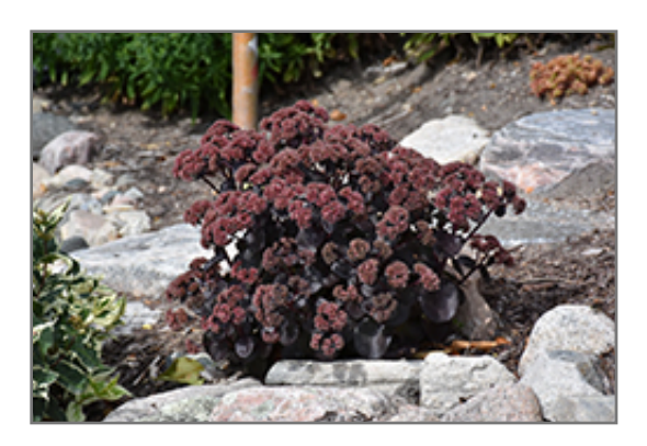
Night Embers Stonecrop in bloom

This is a relatively low maintenance plant, and is best cleaned up in early spring before it resumes active growth for the season. It is a good choice for attracting bees and butterflies to your yard, but is not particularly attractive to deer who tend to leave it alone in favor of tastier treats. It has no significant negative characteristics.