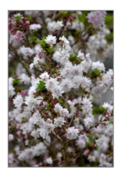
Zuzu Fuji Cherry flowers