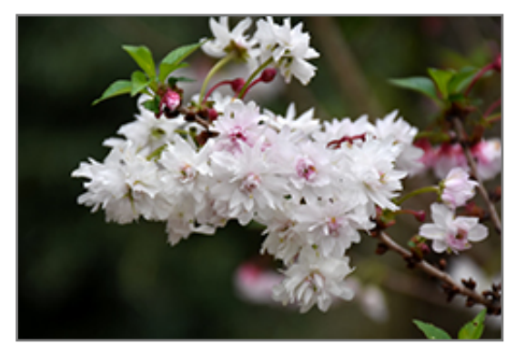
Zuzu Fuji Cherry flowers

This shrub will require occasional maintenance and upkeep, and is best pruned in late winter once the threat of extreme cold has passed. Gardeners should be aware of the following characteristic(s) that may warrant special consideration;