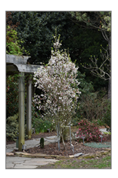
Zuzu Fuji Cherry in bloom

Zuzu Fuji Cherry makes a fine choice for the outdoor landscape, but it is also well-suited for use in outdoor pots and containers. With its upright habit of growth, it is best suited for use as a 'thriller' in the 'spiller-thriller-filler' container combination; plant it near the center of the pot, surrounded by smaller plants and those that spill over the edges. It is even sizeable enough that it can be grown alone in a suitable container. Note that when grown in a container, it may not perform exactly as indicated on the tag - this is to be expected. Also note that when growing plants in outdoor containers and baskets, they may require more frequent waterings than they would in the yard or garden.