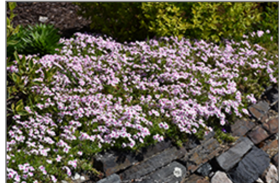
Coral Eye Moss Phlox in bloom