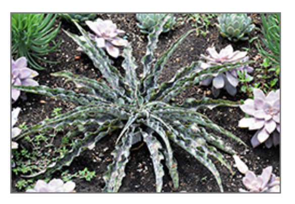
Mint Chocolate Chip Tuberose

Mint Chocolate Chip Tuberose is recommended for the following landscape applications;