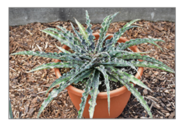
Mint Chocolate Chip Tuberose