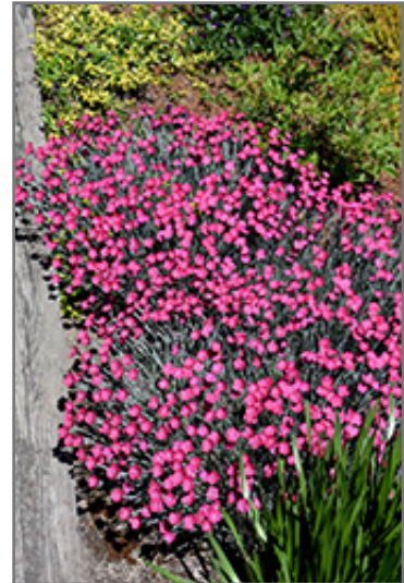
Wicked Witch Pinks in bloom