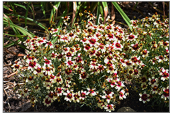
Sizzle And Spice Red Hot Vanilla Tickseed in bloom