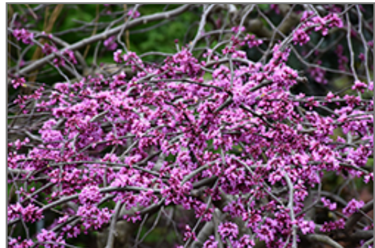
Traveller Weeping Redbud flowers