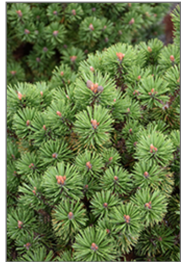
Winchester Dwarf Mugo Pine foliage