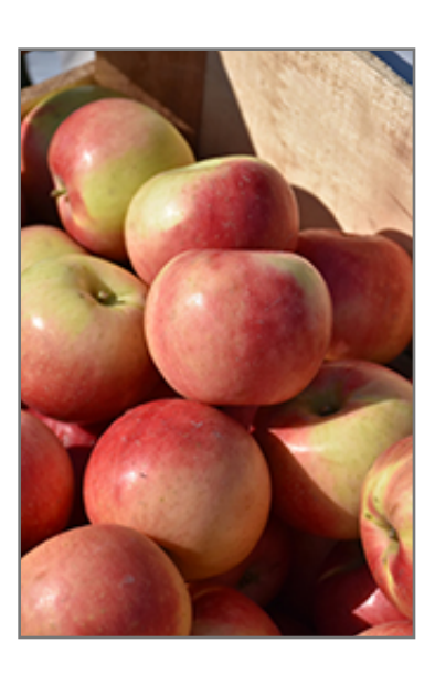
SweeTango Apple fruit

This is a deciduous tree with a more or less rounded form. Its average texture blends into the landscape, but can be balanced by one or two finer or coarser trees or shrubs for an effective composition. This is a high maintenance plant that will require regular care and upkeep, and is best pruned in late winter once the threat of extreme cold has passed. Gardeners should be aware of the following characteristic(s) that may warrant special consideration;