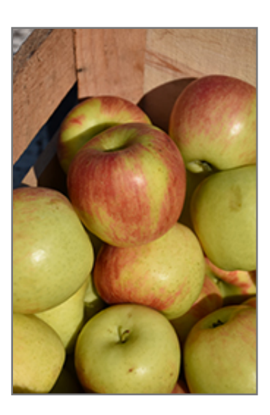
La Crescent Apple fruit