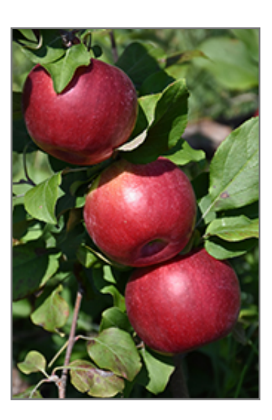
Hazen Apple fruit

Aside from its primary use as an edible, Hazen Apple is sutiable for the following landscape applications;