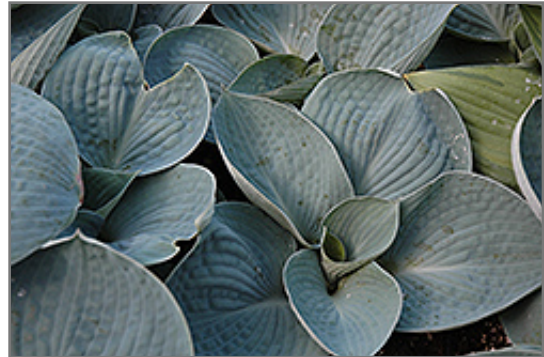
Love Pat Hosta foliage