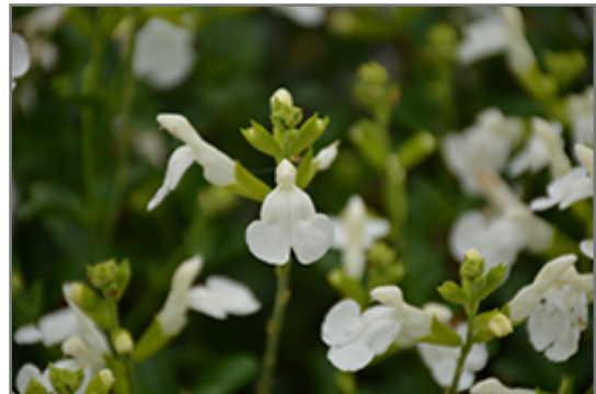
Mirage White Autumn Sage flowers

Mirage White Autumn Sage is recommended for the following landscape applications;