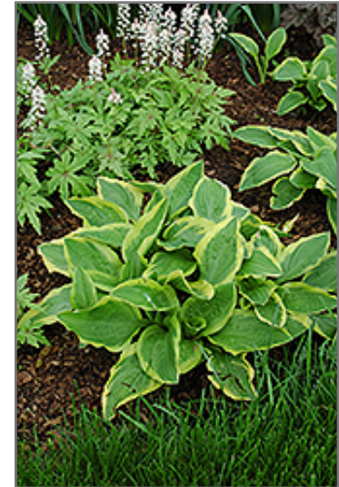
Hertha Hosta