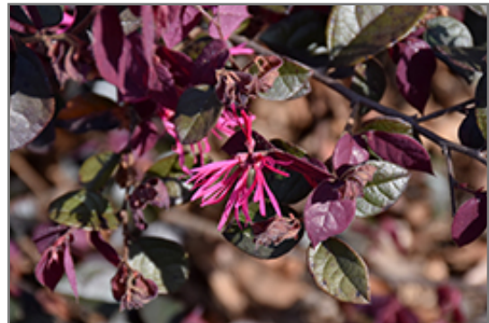
Jazz Hands Bold Fringeflower flowers