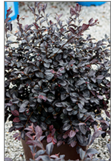
Cherry Blast Fringeflower

Cherry Blast Fringeflower makes a fine choice for the outdoor landscape, but it is also well-suited for use in outdoor pots and containers. Because of its height, it is often used as a 'thriller' in the 'spiller-thriller-filler' container combination; plant it near the center of the pot, surrounded by smaller plants and those that spill over the edges. It is even sizeable enough that it can be grown alone in a suitable container. Note that when grown in a container, it may not perform exactly as indicated on the tag - this is to be expected. Also note that when growing plants in outdoor containers and baskets, they may require more frequent waterings than they would in the yard or garden.