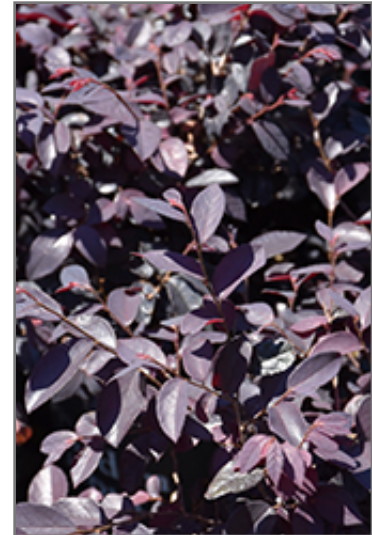
Cherry Blast Fringeflower foliage