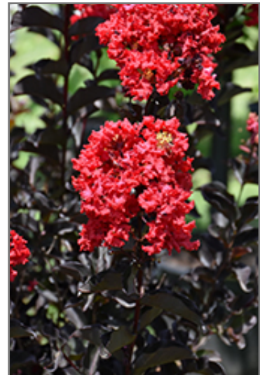
Ebony Fire Crapemyrtle flowers