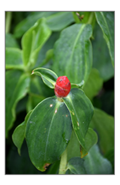
Red Button Ginger flowers