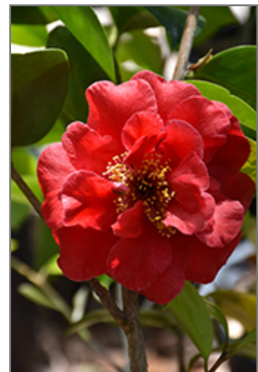
Dixie Knight Camellia flowers