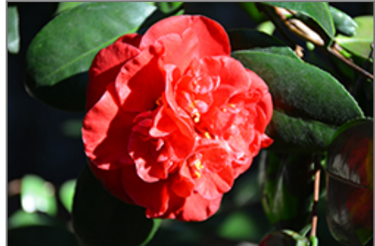
Dixie Knight Camellia flowers

Dixie Knight Camellia is recommended for the following landscape applications;