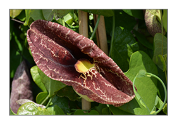
Giant Dutchman's Pipe flowers