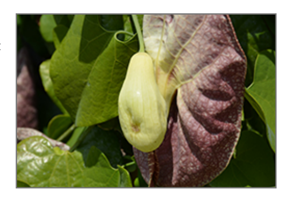
Giant Dutchman's Pipe flowers

This woody vine does best in full sun to partial shade. It prefers to grow in average to moist conditions, and shouldn't be allowed to dry out. It may require supplemental watering during periods of drought or extended heat. It is not particular as to soil type or pH. It is highly tolerant of urban pollution and will even thrive in inner city environments. This species is not originally from North America.