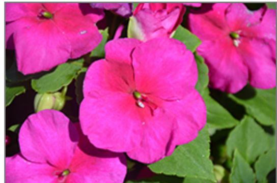
Super Elfin Ruby Impatiens in bloom