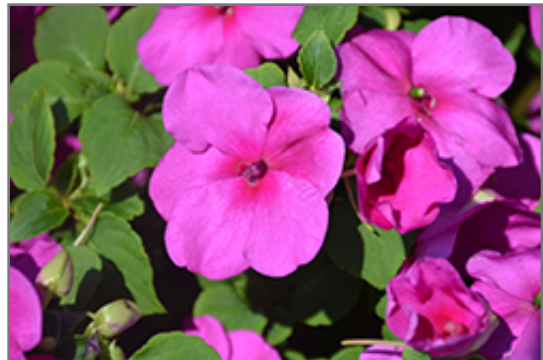
Accent Premium Lilac Impatiens flowers