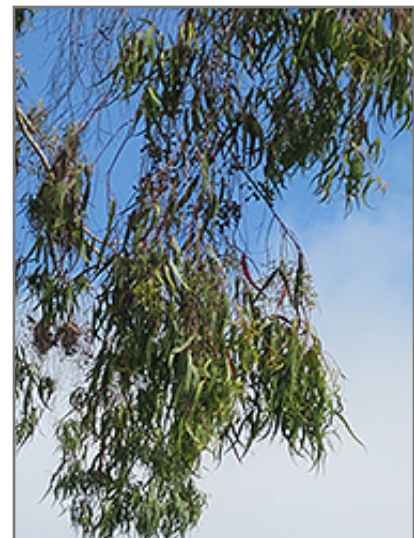
Lemon-scented Gum foliage