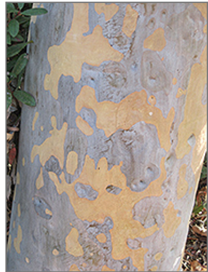
Lemon-scented Gum bark

This tree should only be grown in full sunlight. It prefers dry to average moisture levels with very well-drained soil, and will often die in standing water. It may require supplemental watering during periods of drought or extended heat. It is particular about its soil conditions, with a strong preference for sandy, acidic soils, and is able to handle environmental salt. It is somewhat tolerant of urban pollution. This species is not originally from North America.