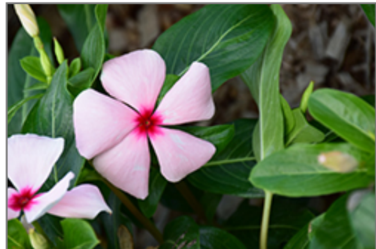
Mega Bloom Apricot Vinca flowers

Mega Bloom Apricot Vinca is recommended for the following landscape applications;