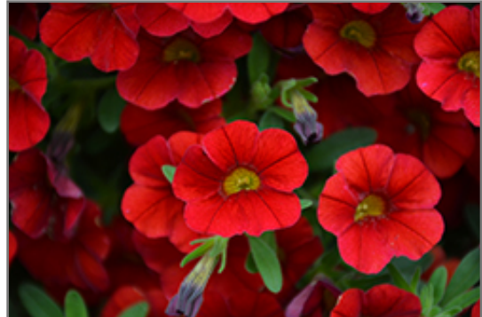
MiniFamous Neo Vampire Calibrachoa flowers

This plant will require occasional maintenance and upkeep. Trim off the flower heads after they fade and die to encourage more blooms late into the season. It is a good choice for attracting bees and hummingbirds to your yard, but is not particularly attractive to deer who tend to leave it alone in favor of tastier treats. It has no significant negative characteristics.