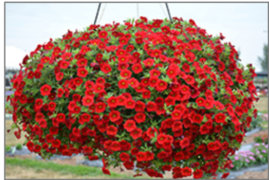
MiniFamous Neo Vampire Calibrachoa in bloom

MiniFamous Neo Vampire Calibrachoa is a fine choice for the garden, but it is also a good selection for planting in outdoor containers and hanging baskets. Because of its trailing habit of growth, it is ideally suited for use as a 'spiller' in the 'spiller-thriller-filler' container combination; plant it near the edges where it can spill gracefully over the pot. Note that when growing plants in outdoor containers and baskets, they may require more frequent waterings than they would in the yard or garden.