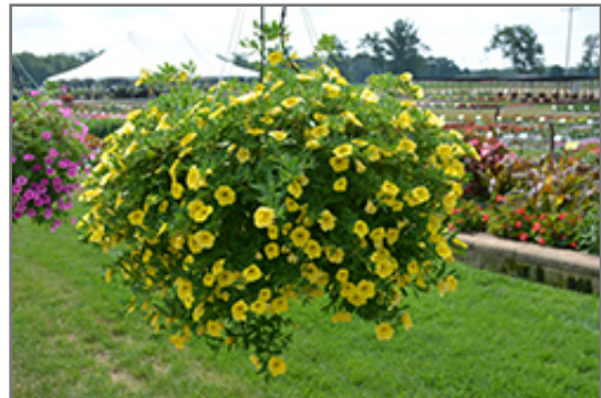
MiniFamous Neo Deep Yellow Calibrachoa in bloom

MiniFamous Neo Deep Yellow Calibrachoa is a fine choice for the garden, but it is also a good selection for planting in outdoor containers and hanging baskets. Because of its trailing habit of growth, it is ideally suited for use as a 'spiller' in the 'spiller-thriller-filler' container combination; plant it near the edges where it can spill gracefully over the pot. Note that when growing plants in outdoor containers and baskets, they may require more frequent waterings than they would in the yard or garden.