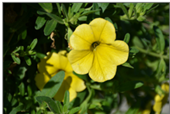
MiniFamous Neo Deep Yellow Calibrachoa flowers