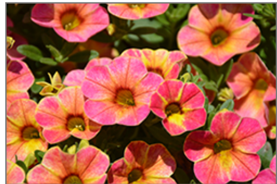
Chameleon Sunshine Berry Calibrachoa flowers