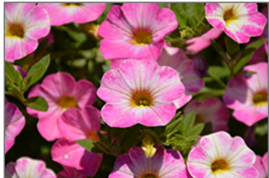
Chameleon Pink Sorbet Calibrachoa flowers

Chameleon Pink Sorbet Calibrachoa is recommended for the following landscape applications;