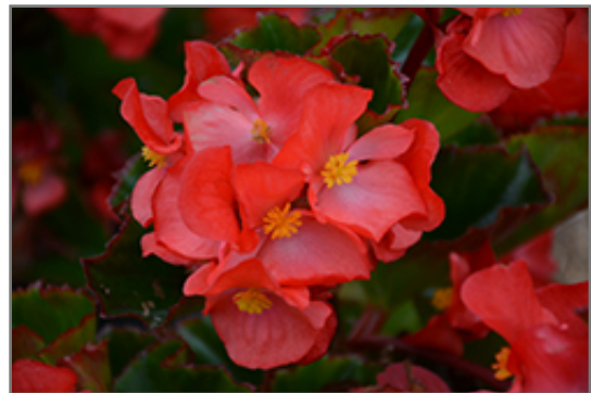
Megawatt Red Green Leaf Begonia flowers