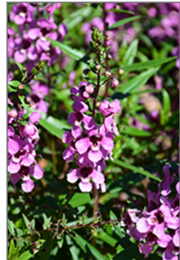
Sungelonia Pink Angelonia flowers

Sungelonia Pink Angelonia is recommended for the following landscape applications;