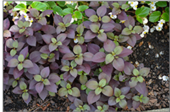
Purple Prince Alternanthera foliage