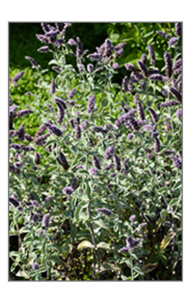
Horse Mint flowers