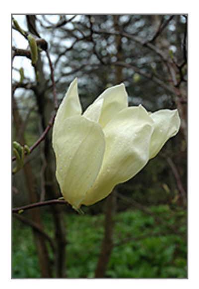
Cucumber Magnolia flowers