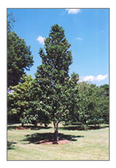
Cucumber Magnolia

This tree does best in full sun to partial shade. It requires an evenly moist well-drained soil for optimal growth, but will die in standing water. It may require supplemental watering during periods of drought or extended heat. It is not particular as to soil type, but has a definite preference for acidic soils. It is quite intolerant of urban pollution, therefore inner city or urban streetside plantings are best avoided. Consider applying a thick mulch around the root zone in winter to protect it in exposed locations or colder microclimates. This species is native to parts of North America.