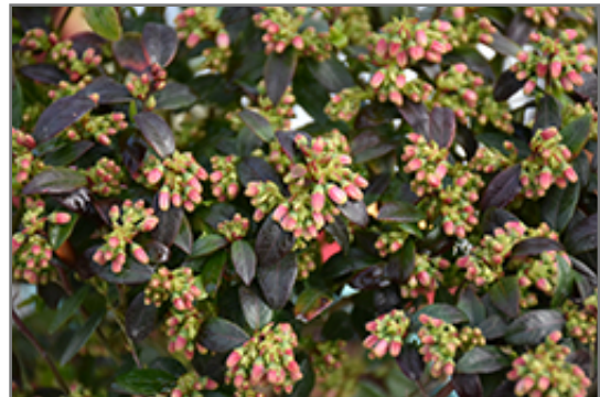
Blueberry Glaze Blueberry flowers

This is a multi-stemmed deciduous shrub with a mounded form. Its average texture blends into the landscape, but can be balanced by one or two finer or coarser trees or shrubs for an effective composition. This is a relatively low maintenance plant, and usually looks its best without pruning, although it will tolerate pruning. It is a good choice for attracting birds to your yard. It has no significant negative characteristics.