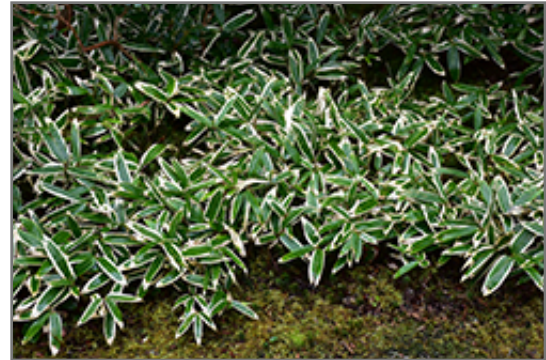
Veitch's Bamboo