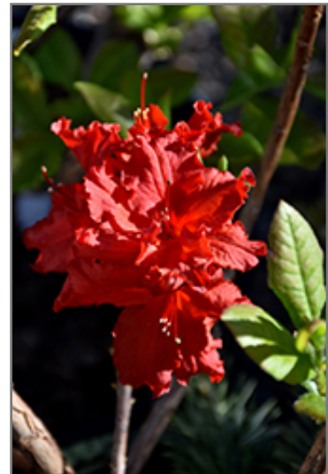
Red Sunset Azalea flowers

Red Sunset Azalea will grow to be about 7 feet tall at maturity, with a spread of 5 feet. It tends to be a little leggy, with a typical clearance of 1 foot from the ground, and is suitable for planting under power lines. It grows at a slow rate, and under ideal conditions can be expected to live for 40 years or more.