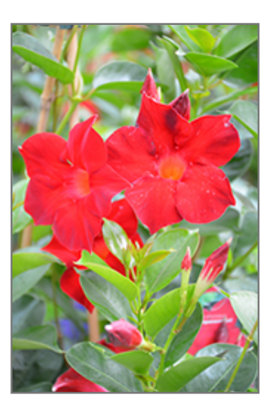
Sun Parasol Dark Red Mandevilla flowers

When grown indoors, Sun Parasol Dark Red Mandevilla can be expected to grow to be about 10 feet tall at maturity, with a spread of 24 inches. It grows at a medium rate, and under ideal conditions can be expected to live for approximately 20 years. This houseplant will do well in a location that gets either direct or indirect sunlight, although it will usually require a more brightly-lit environment than what artificial indoor lighting alone can provide. It requires an evenly moist well-drained soil for optimal growth. The surface of the soil shouldn't be allowed to dry out completely, and so you should expect to water this plant once and possibly even twice each week. Be aware that your particular watering schedule may vary depending on its location in the room, the pot size, plant size and other conditions; if in doubt, ask one of our experts in the store for advice. It is not particular as to soil type or pH; an average potting soil should work just fine. Be warned that parts of this plant are known to be toxic to humans and animals, so special care should be exercised if growing it around children and pets.