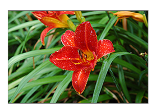
Taiga Fire Daylily flowers