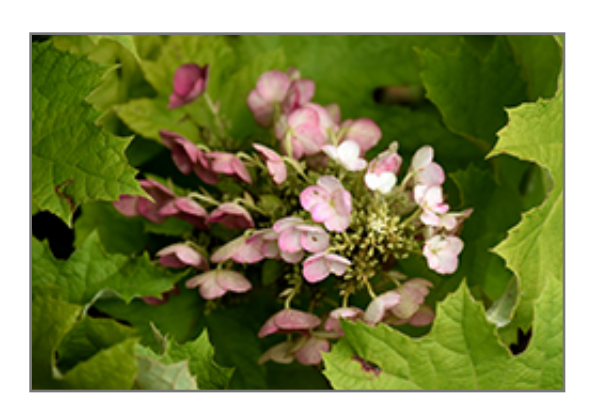
Amethyst Hydrangea flowers