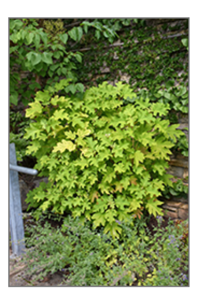
Amethyst Hydrangea