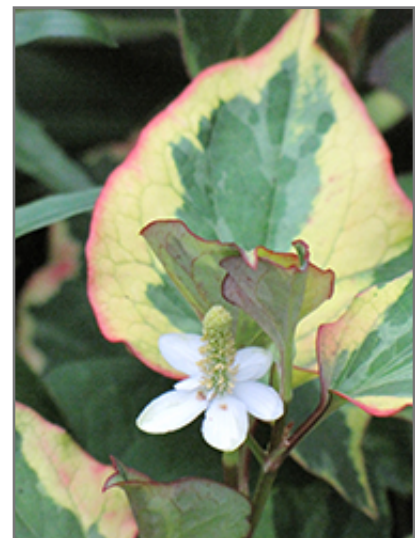
Chameleon Houttuynia flowers