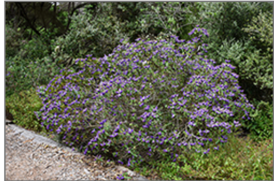
Blue Gem Hebe in bloom