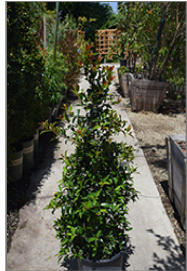
Monterey Bay Brush Cherry