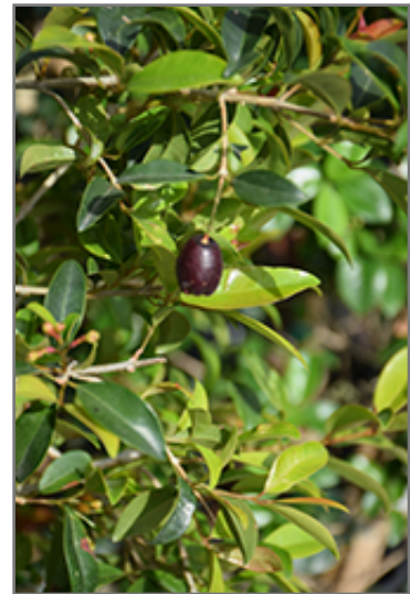
Monterey Bay Brush Cherry fruit

Monterey Bay Brush Cherry is a fine choice for the yard, but it is also a good selection for planting in outdoor pots and containers. Its large size and upright habit of growth lend it for use as a solitary accent, or in a composition surrounded by smaller plants around the base and those that spill over the edges. It is even sizeable enough that it can be grown alone in a suitable container. Note that when grown in a container, it may not perform exactly as indicated on the tag - this is to be expected. Also note that when growing plants in outdoor containers and baskets, they may require more frequent waterings than they would in the yard or garden.