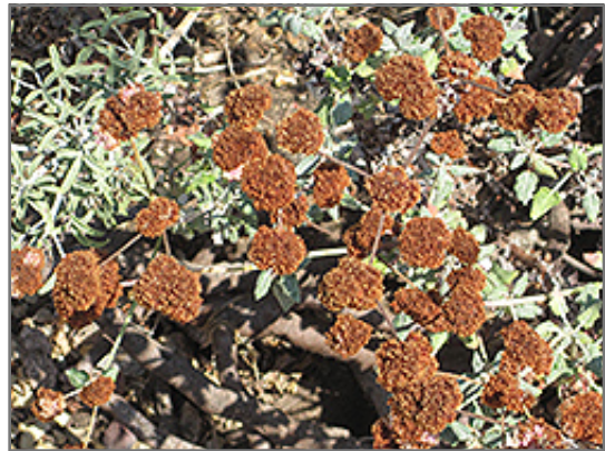
Red Buckwheat fruit

Red Buckwheat will grow to be about 12 inches tall at maturity extending to 24 inches tall with the flowers, with a spread of 30 inches. Its foliage tends to remain dense right to the ground, not requiring facer plants in front. It grows at a medium rate, and under ideal conditions can be expected to live for approximately 10 years. As an herbaceous perennial, this plant will usually die back to the crown each winter, and will regrow from the base each spring. Be careful not to disturb the crown in late winter when it may not be readily seen!