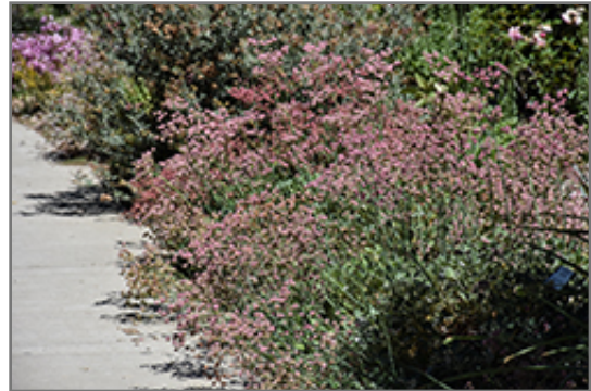
Red Buckwheat in bloom