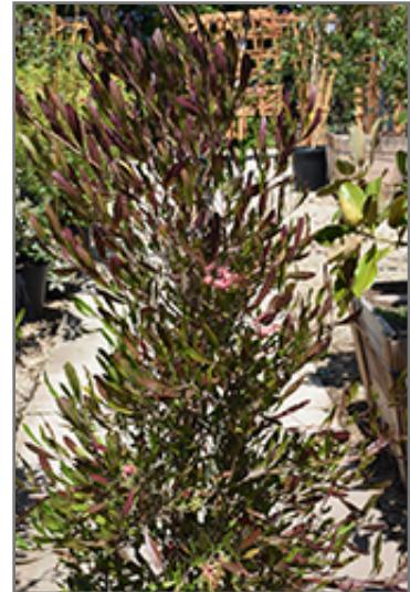
Purple Hop Bush