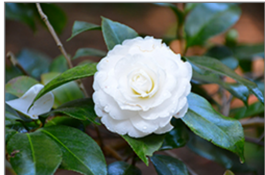
Alba Plena Camellia flowers