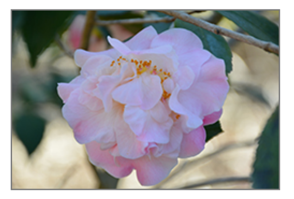
High Fragrance Camellia flowers