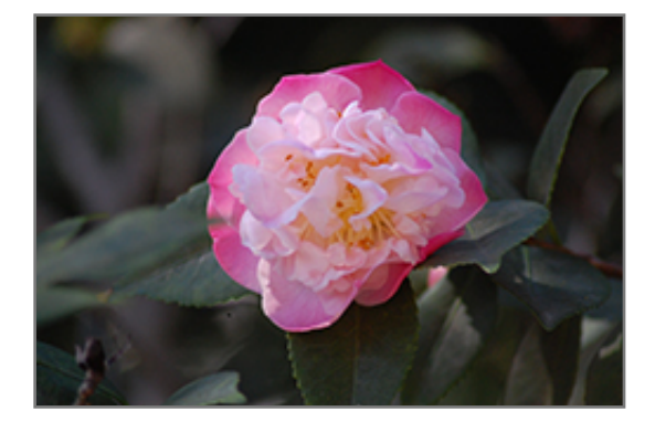
High Fragrance Camellia flowers